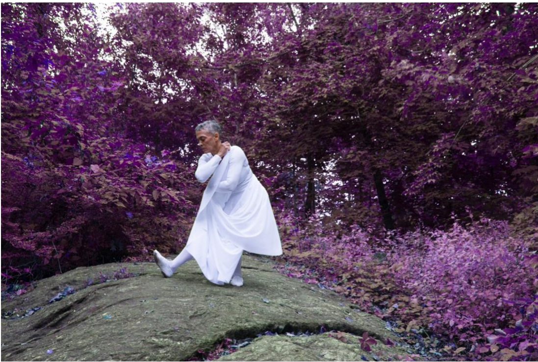
Elia Alba "The Spiritualist (Maren Hassinger)" (2013). Archival pigment print.

What is a portrait for? On consideration, it's apparent that any portrait is a record, an act of documentation. It is also a display object, an iconic representation of the person (excluding pictures of animals) that should hold a convincing resemblance to the real person. Having seen a good portrait, we might, in running into the actual subjects in the street, stop them to say, "I've seen you somewhere before." Portraits are also acts of intentional