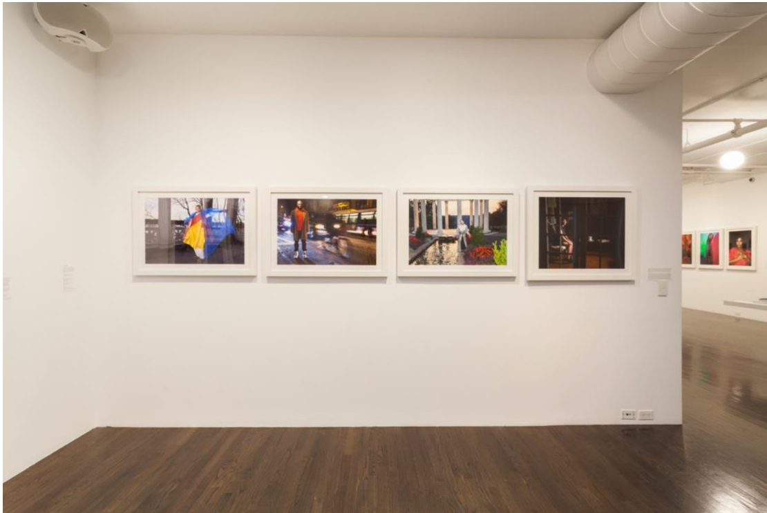
Installation view of The Supper Club at The 8th Floor gallery.