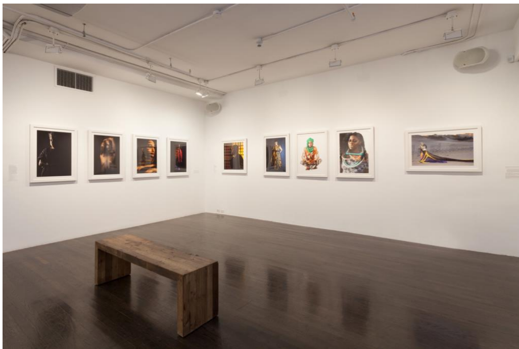
Installation view of The Supper Club at The 8th Floor gallery.