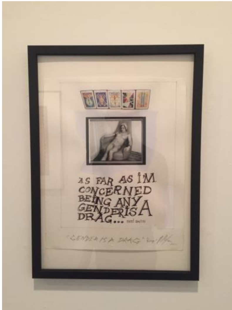
Genesis Breyer P-Orridge, "Gender is a Drag" (2011), mixed media, 14 x 11 inches

GBPO: Okay, so both intersectionality and pandrogyny address the problematic issues of the body, identity, and socioeconomics. How do they interact and what do they mean? For us, it's also a spiritual issue, which is something contemporary art avoids. The origin of art goes back to prehistoric times when people didn't know if the sun would come back the next day. Our idea of consciousness was still primitive, and there was a terrible fear of the darkness. That fear gradually gripped civilization, which required control. And there was a long period of about 3,000 years when everyone linked their individuality with the idea of perpetuating groups. It was about submission: submission to individuals in order to survive. But we are past there! The problem is that some people still want to maintain