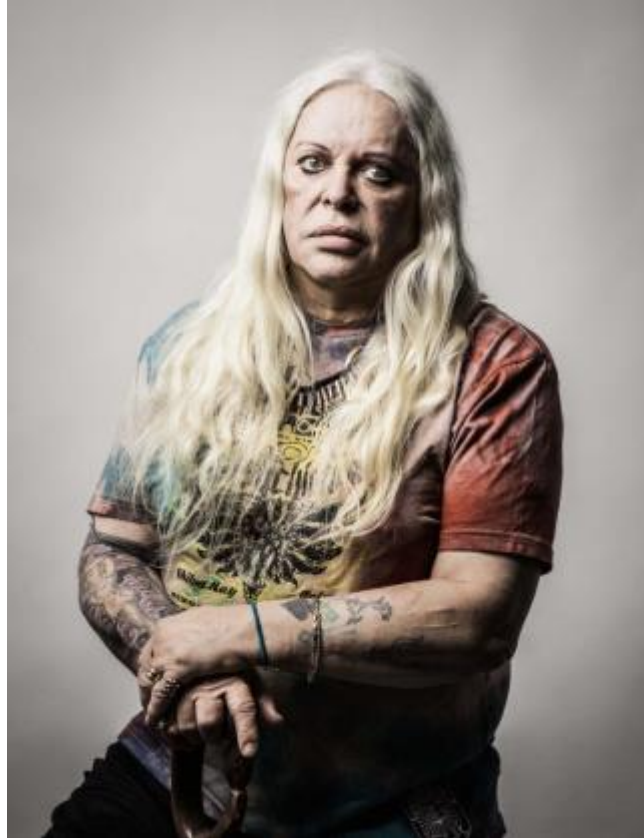
Genesis Breyer P-Orridge

ZS: Right, because the bureaucracy can only understand so much. It makes me think of the idea of comedy as rebellion, and I sense elements of comedy in your work. Would you agree?