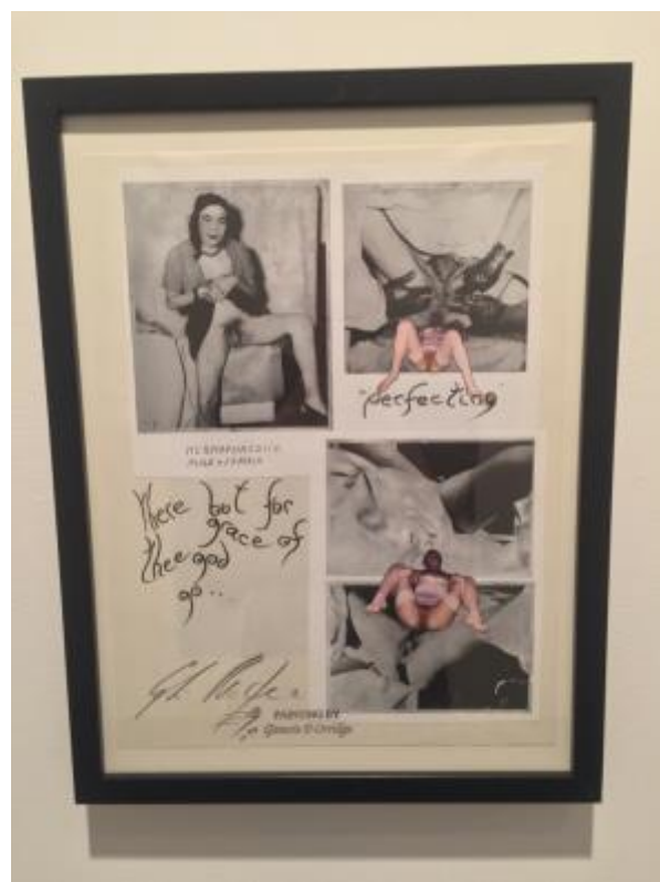
Genesis Breyer P-Orridge, "Perfecting, undated," mixed media, 14 x 11 inches

GBPO: No. What's really depressing for us is how long the art world has followed in the shadow of the Young British Artists. Initially, they were smart, funny, and clever. "We hate art and there it is." But now everyone wants to brand themselves that way. They aren't thinking about content. Art must have a story, comment, some kind of information that you can take away. That's the definition of art: creation.