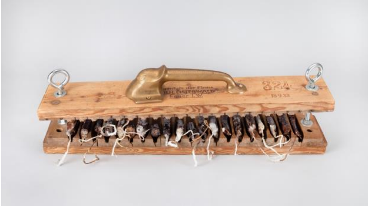
Genesis Breyer P-Orridge, "Mousetrap" (2016), cigar press, tampons, menstrual blood, resin, brass, 24.75 x 15 x 5.25 inches

Zachary Small: How would you define intersectionality? Do you ascribe to that phrase? Is pandrogyny intersectional?