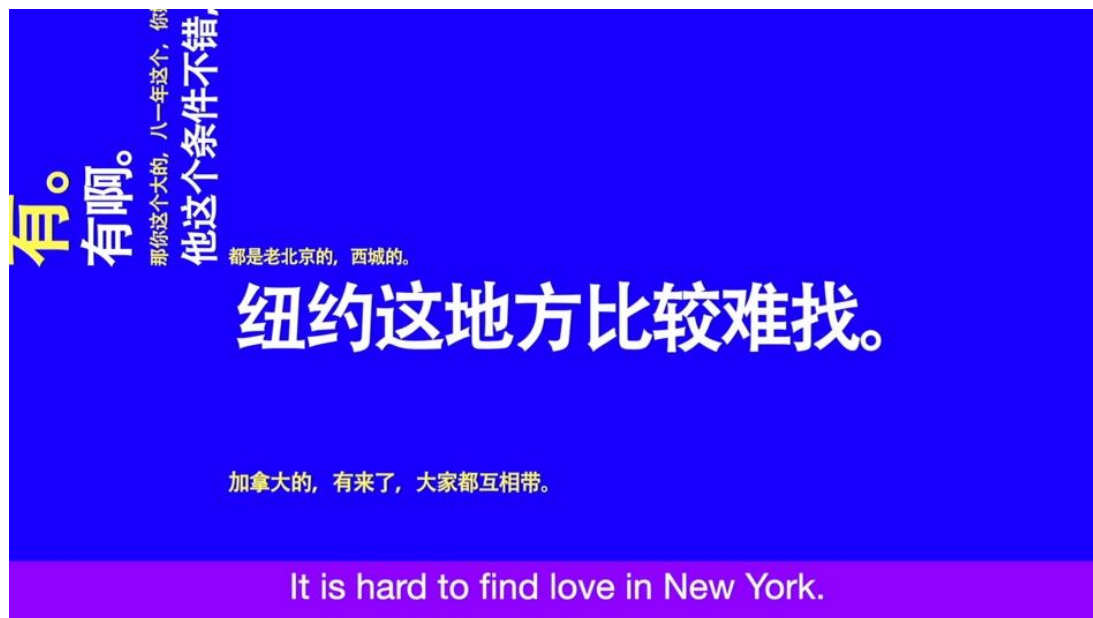
Furen Dai, Love for Sale , 2020. Video (color, sound), 7:03min. Video still.

Various strands running through this exhibition are aptly captured by the exhibition title originating from a 1960s poem by Adrienne Rich, “Snapshots of a Daughter-in-Law.” In this poem Rich describes the universe constructed by and for men where we, women, are present in our difference, in our divergence from the norm, from the dogma and the expected molds. All works selected for this exhibition show the resistance, feminist unwillingness to succumb, or at the very least they shine the light of reason onto mindless patriarchal rituals of power. Traditions, social customs and their dogmatic, inescapable, stabilizing pressure constitute the foundation of a status quo, a factor so cynically used by men to justify the suffering, abuse, negligence, othering of women. Yet, the exhibition also includes satisfying alternatives, creative avenues of resistance and fight. Commodification of women as objects for marital transactions, othering, question of consent, and active resistance by women are the themes I picked up, but the show tells multitude of stories, waiting to be discovered by the viewers.