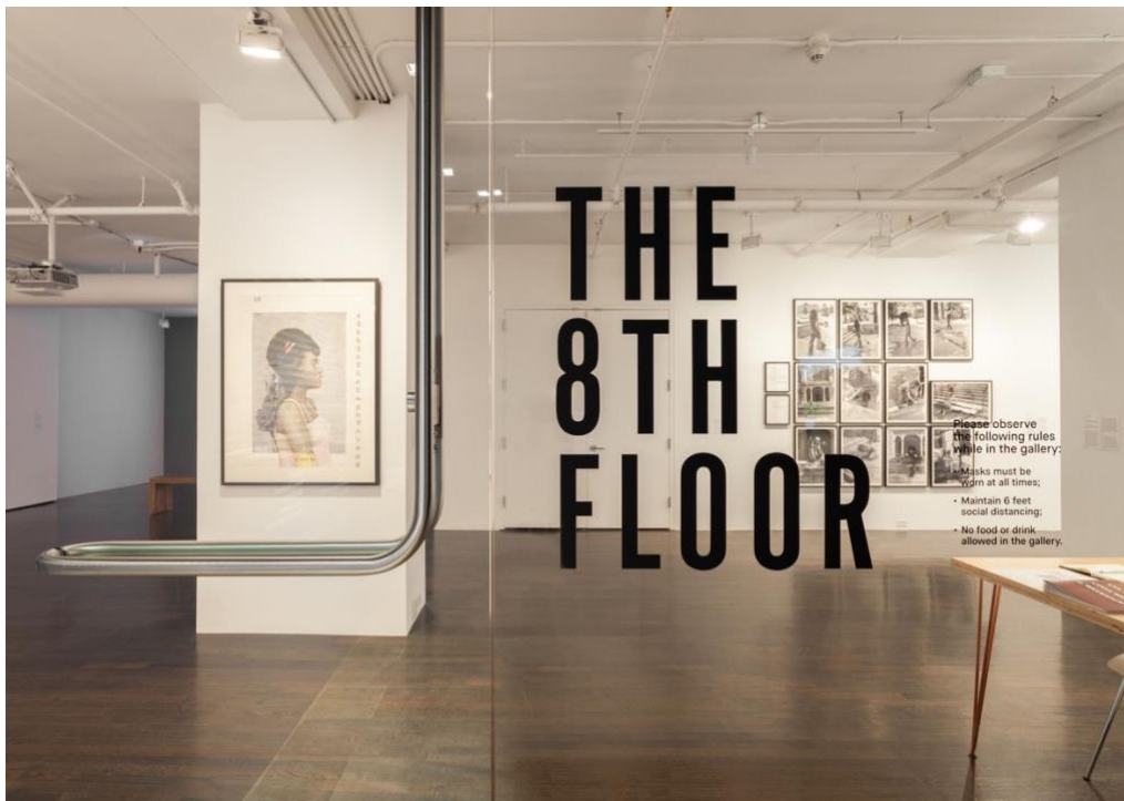
Installation photo, To Cast Too Bold a Shadow , October 15, 2020 - February 6, 2021. The 8th Floor.